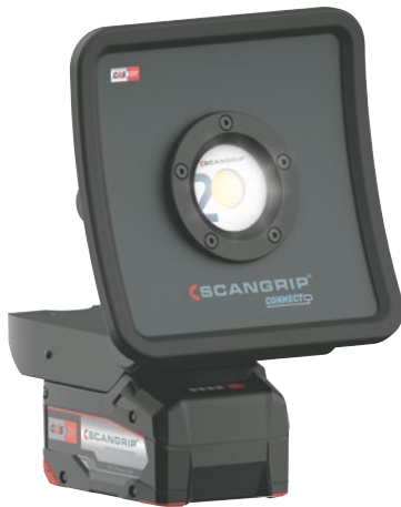
036100C / 2XM 530 302-471 SCANGRIP CONNECT NOVA 2 (with optional CAS battery pack)

The CONNECT NOVA 4 features an integrated carry handle, built-in battery backup, a Bluetooth app for remote control of up to 4 lights, as well as supporting SCANGRIP TRIPOD mounting, and an IP 65 waterproofing rating.