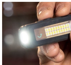
Top Spotlight for precision illumination