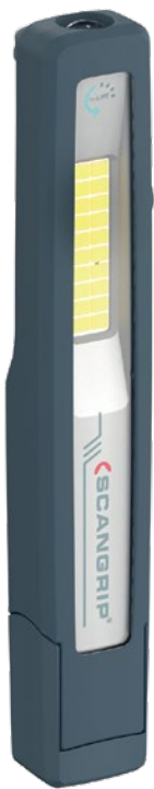
036209 SCANGRIP UNIPEN Inspection Lamp

NOTE: This lamp replaces 035420 UNIPEN LED Inspection Lamp.