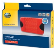
2SB 017 007-002 DuraLED®-S Stop/Rear Position Lamp with Night Light Retail Pack