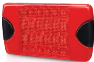
2SB 017 007-00X DuraLED®-S Stop/Rear Position Lamp with Night Light