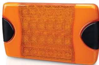
2BA 017 006-00X DuraLED®-S Rear Direction Indicator Lamp