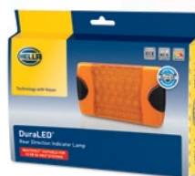
2BA 017 006-002 DuraLED®-S Rear Direction Indicator Lamp Retail Pack