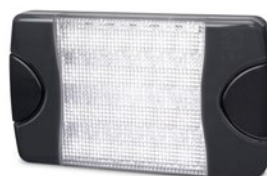
Reverse light (Lens appears clear until lit) 2ZR 017 008-201