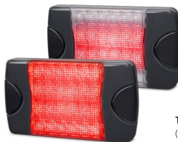
Tail and stop light (Lens appears clear until lit) 2SB 017 007-201