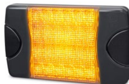
Rear direction indicator light (Lens appears clear until lit) 2BA 017 006-201