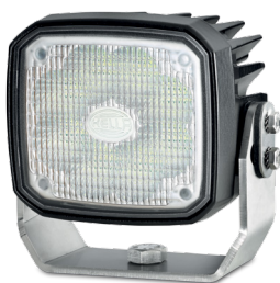
P/N 1566-HD Close Range Work Lamp - Heavy Duty