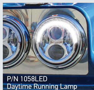
P/N 1058LED Daytime Running Lamp