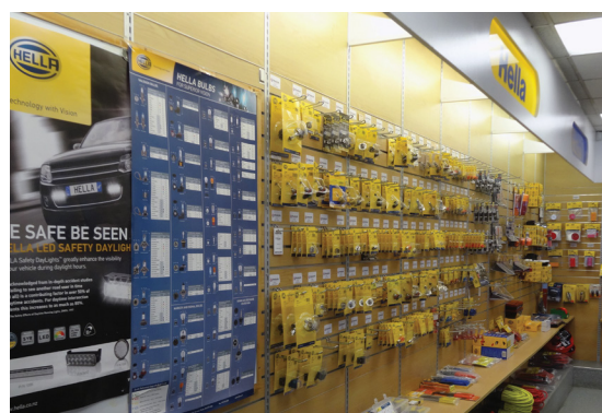
A fully stocked showroom with all the latest HELLA products.

Head Office: 80 - 86 Kermode Street, Ashburton 7700, New Zealand Ph: (03) 308 7234 Email: sales@newlands.net.nz www.newlands.net.nz