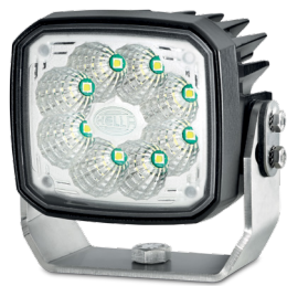
P/N 1566-HDLR Long Range Work Lamp - Heavy Duty

The integrated Multivolt™ electronics protect the device in the event of polarity inversion and guarantee constant brightness, even when operating with voltage fluctuations between 9 and 33 Volts.