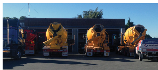
Busy day ahead at the purpose built workshop facility.