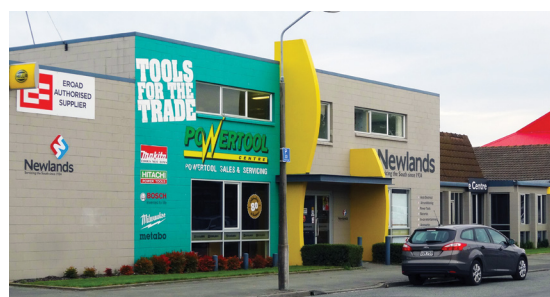
The growing diversity of the business was reflected in the rebrand as Newlands Group in 2000.