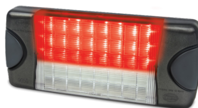
P/N 2XA 959 050-321 DuraLED® Combi Red/Green LED Warning Lamp (Showing Red-High)

This DuraLED® red/green warning lamp is designed as a stop/go lamp to signal when it is safe or dangerous to approach and/or work on a vehicle. The red signal has two outputs, either 1.5W or 6W, allowing the lamp to function even for long periods (e.g. overnight) without draining batteries. It may also be used as a signal when it is safe/not safe to pass a slow vehicle (e.g. on a closed road).