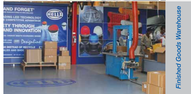
Finished Goods Warehouse