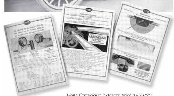
Hella Catalogue extracts from 1929/30

Hella New Zealand strives to provide world-class products that contribute to the safety of the automotive and transport industry through enhanced vision and visibility.